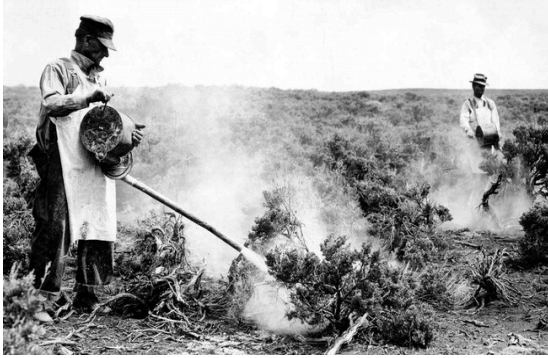
Application of sodium arsenite dust to control Mormon crickets in Wyoming circa 1935.