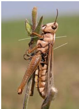
Left: A grasshopper cadaver showing the classic orientation and clasping at or near the top of vegetation that is indicative of Summit disease.

This disease is caused by the fungal pathogen Entomophaga grylli , and occasionally can serve to control grasshopper populations. Humidity requirements for the disease have usually limited its effects to localized areas in Idaho.