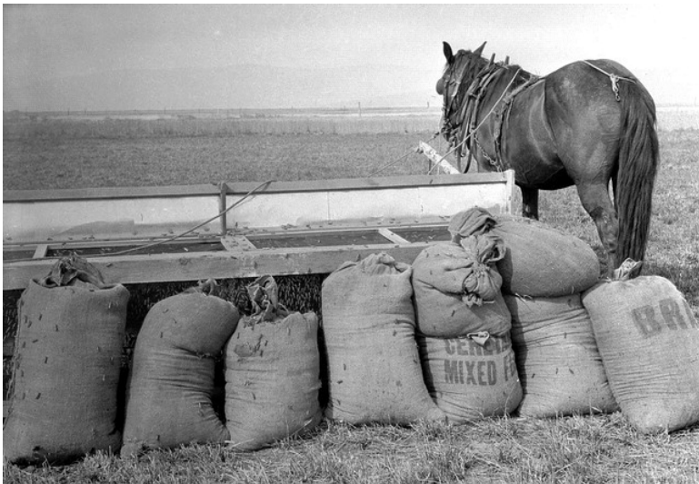
Horse drawn grasshopper catching machine circa 1917 with catch bagged for use as poultry feed.